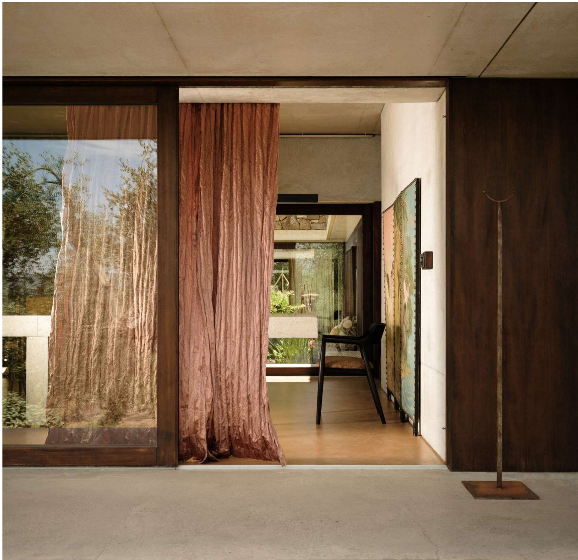
CURTAIN IN VISCOSE AND COTTON FABRIC, ENRICHED WITH METALLIC FIBERS THAT GIVE IT A SCULPTURAL, TEXTURED APPEARANCE.

PREVIOUS PAGES: LINEN TABLECLOTH WITH TOILE DE JOUY PRINT, REINTERPRETED IN VARIOUS SHADES AND HUES, OVER-DYED WITH TEA TO CREATE A LIVED-IN LOOK.