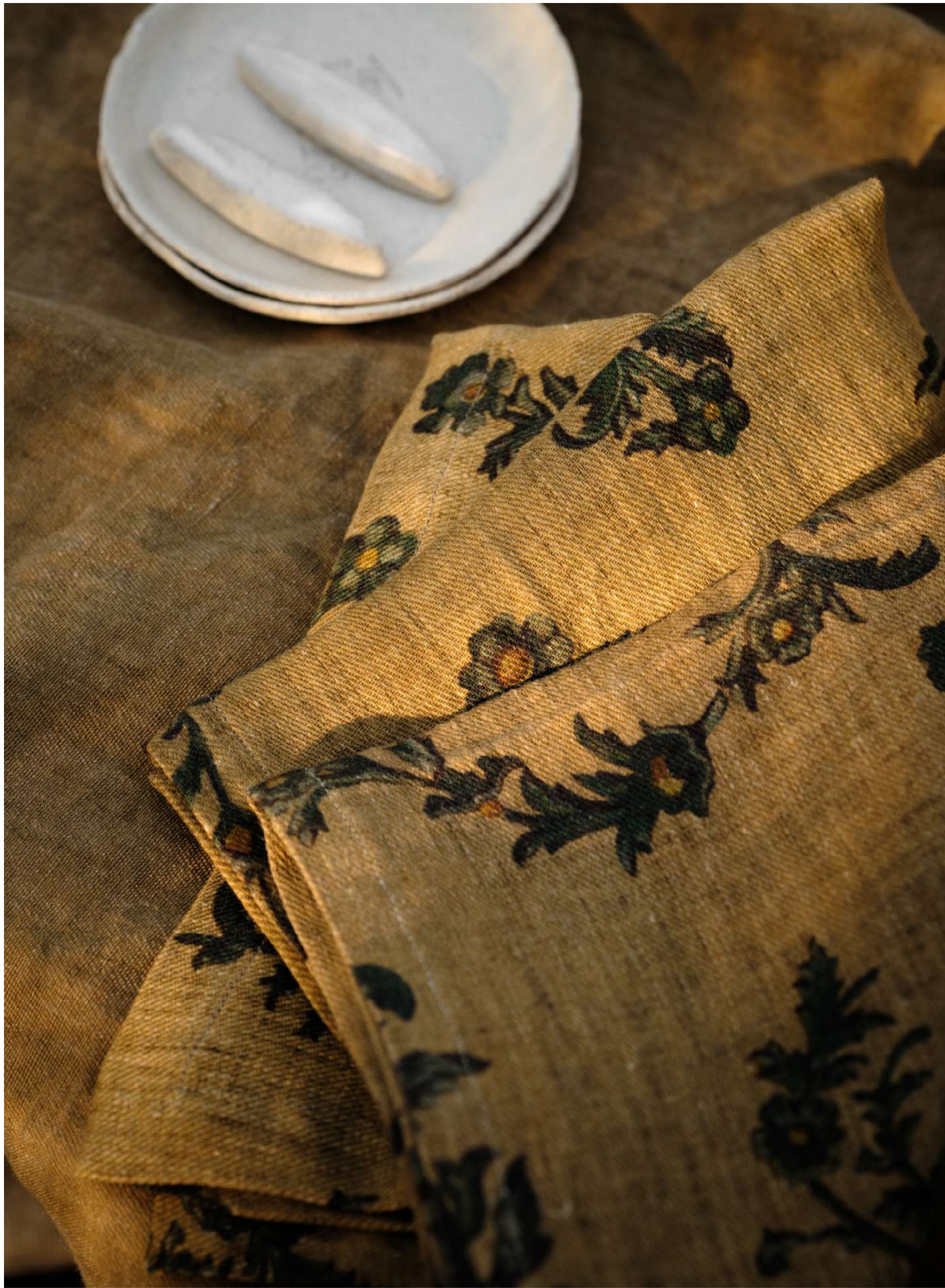
LEFT: LINEN NAPKINS WITH BOTANICAL PRINT, OVER-DYED WITH NATURAL PIGMENTS TO CREATE A LIVED-IN LOOK. RIGHT: PIGMENT-DYED LINEN TABLECLOTH; LINEN CUSHIONS DYED WITH NATURAL PIGMENTS, FEATURING RUFFLES CREATED WITH TWO DIFFERENT FABRIC WEAVES.