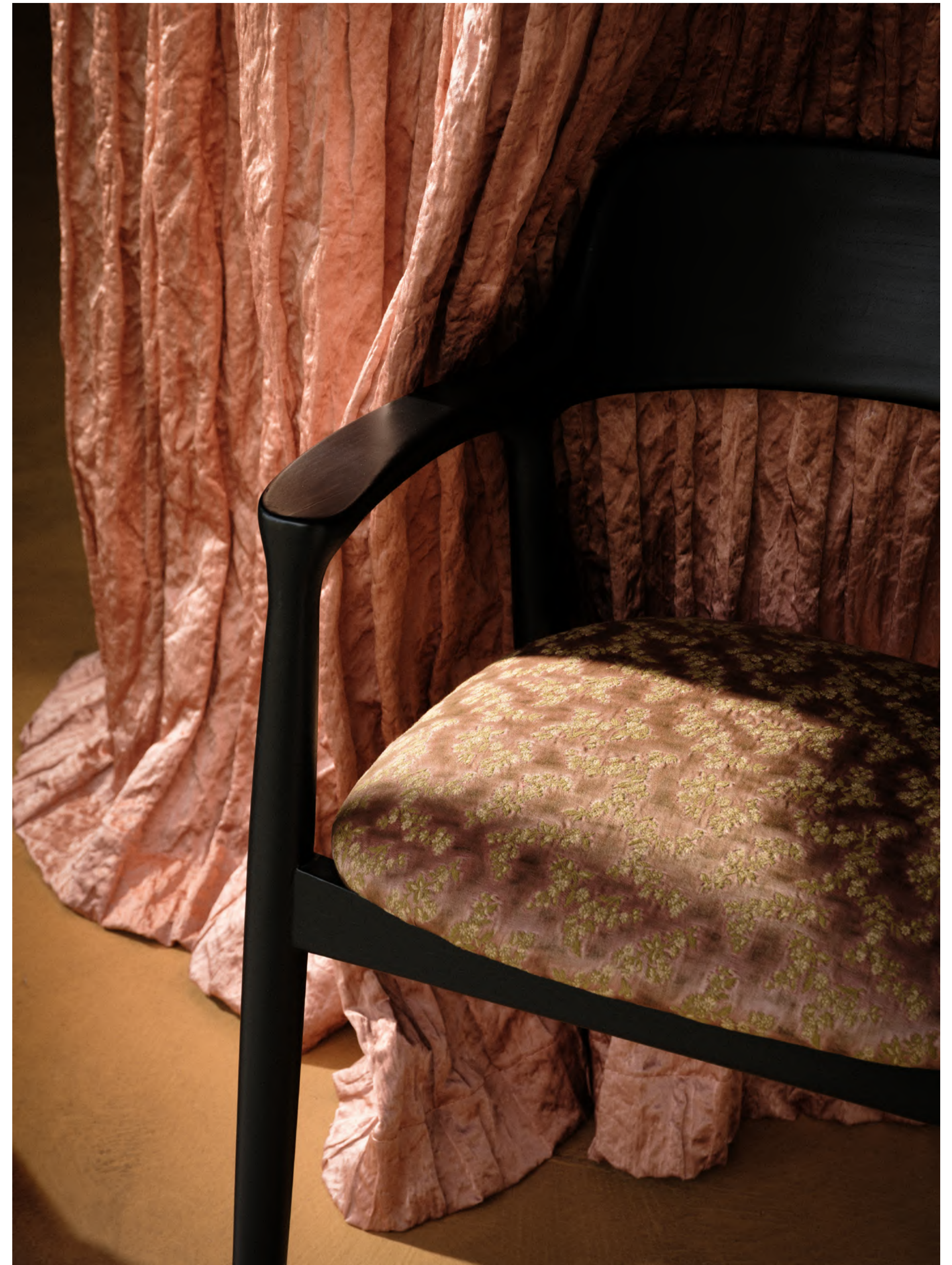
ARMCHAIR IN LINEN AND SILK JACQUARD FABRIC, FEATURING AN IRREGULAR LIVED-IN LOOK ACHIEVED THROUGH PIGMENT OVERDYEING.

PREVIOUS PAGES: LINEN TABLECLOTH WITH TOILE DE JOUY PRINT, REINTERPRETED IN VARIOUS SHADES AND HUES, OVER-DYED WITH TEA TO CREATE A LIVED-IN LOOK.